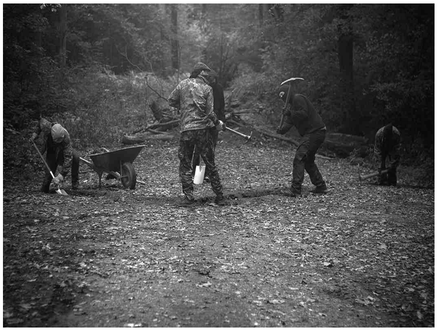
Building barricades and trenches

solidarity towards the radical anti-coal-campaign like the coal-action-network in the U.K., risingtide-groups in Australia and North-America, or the "wij stoppen steenkool" campaign in the Netherlands. With their direct form of action, these groups gave an us inspiration, and we hope that these actions will inspire other groups world-wide as well.