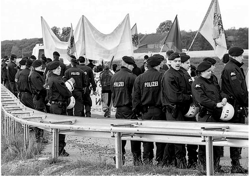
26th April - the demonstation

25.04. trial against one activist in Kerpen. Decision: a fine