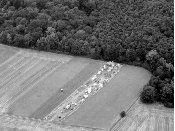
the occupied meadow

13.-16.11 . The forest occupation is evicted by 500 police"men" as well as climbing squads. Various activists are locked-on (chained) to cubes of concrete