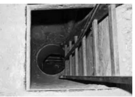
entrance to the tunnel at the first occupation

The name should be self-explanatory: You dig a tunnel and then you entrench yourself inside to make an eviction harder. Originally this form of action comes from England, where it was practiced first in 1993. Some of the local tunnel evictions took some months. The tunnel eviction in the Hambacher Forest took only four days but with this it was already the longest eviction of the german-speaking area.