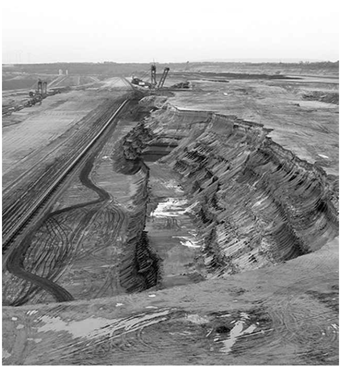
the open cast pit

Here in the Rhenish mining area, between Düsseldorf, Cologne and Aachen, the energy giant RWE is digging the largest holes of Europe - to extract lignite, the dirtiest fossil energy source currently used. This is then conveyed by the coal railway to the five surrounding power plants where it is burnt. Together, these power plants constitute Europe's largest CO<sup>2</sup> emitter, and thus the 'climate killer # 1'. The fact that such a massive intervention in our common habitat prevail solely through domination, appears