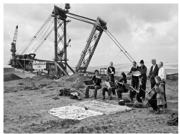
Orchestra "Lebenslaute" – October 2012

"Lebenslaute" combines classical music with civil disobedience and expresses its political convictions by concerts in unusual places. In