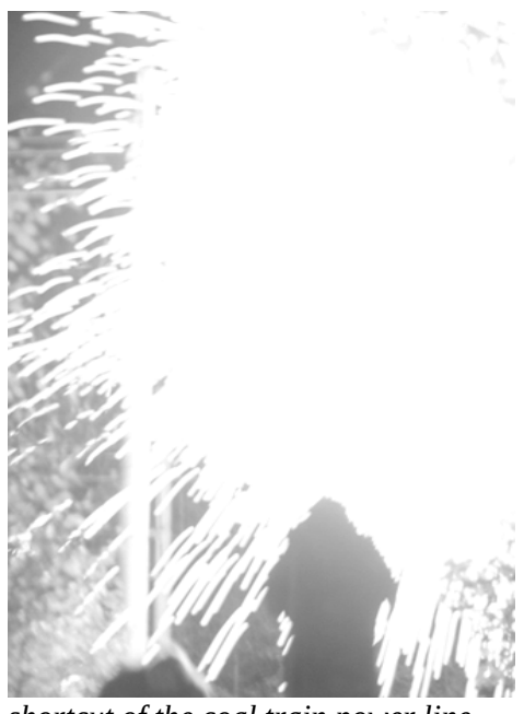
shortcut of the coal train power line

01.10.13 -01.03.14 Officially this period is the "cutting season" during which RWE goes ahead with the clearcuts. Anyhow they still saw and shred wood untill mid May. To prevent actions against this they close all access roads and bridges and put up floodlights, fences and security posts. Anyhow some machines for the cutting are sabotaged and trees are spiked with nails.