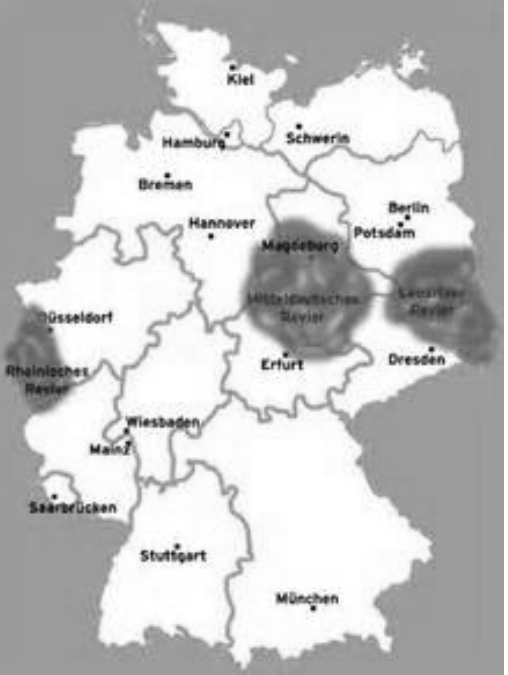
Areas of lignite mining in Germany – the Rhenish, the middle-german and the Lausitzer mining area (from west to east)

For the biggest nowadays running mine there - the mine 'Hambach' – the forest 'Hambacher Forst' is being cut since 1978. The plan of the company is to completely clearcut the forest untill 2018.