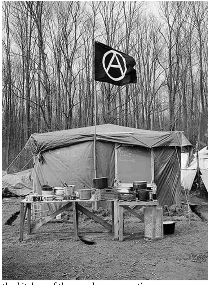
the kitchen of the meadow occupation

that because of all this thousands of people die each year is therefore a necessity for enforcing and maintaining privileges and domination.